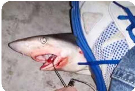
Shark having a hook removed from his mouth after being caught by recreational fishermen.

Rockfish with barotrauma, caused by decompression.