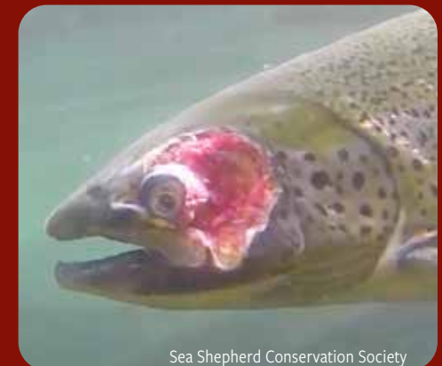
Sea Shepherd Conservation Society