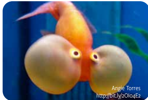
Angie Torres http://bit.ly/2Olo4E2 Bubble Eye Goldfish.

Freshwater fish are mass bred in unsanitary facilities that are the underwater equivalent of puppy mills . Fish are commonly transported to pet shops in tiny bags (which are pumped with chemicals) and held in severely overcrowded and disease-ridden tanks . They are often starved during transportation.