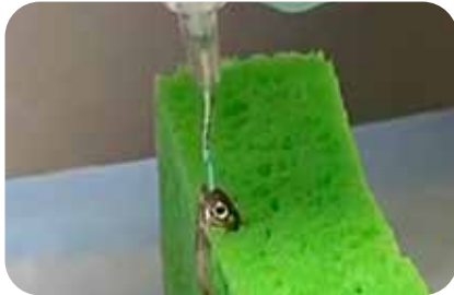
Zebrafish being force-fed chemicals with a tube.