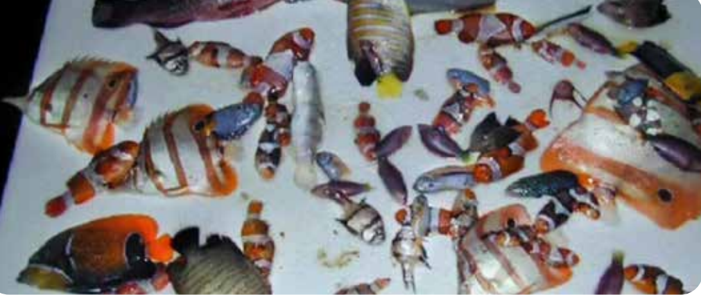
Discarded carcasses of marine fish who died during capture for the pet trade.