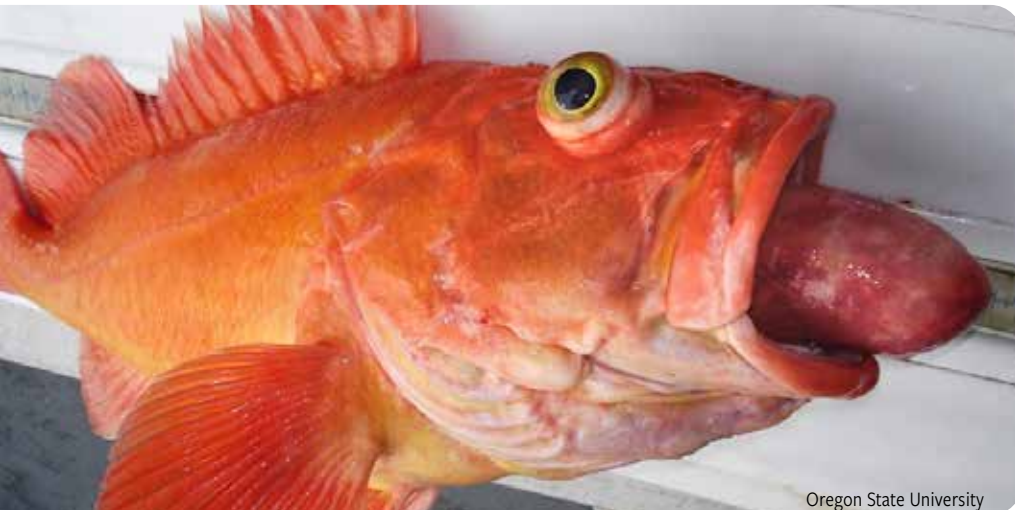
Oregon State University

Up to 86 percent of caught fish die from their injuries if they are released.