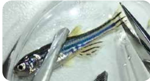
Zebrafish having a portion of his tail cut off for use as a skin sample.

The use of fish for experimentation is dramatically increasing. Most of this increase is due to the breeding of genetically modified animals who are engineered to have genetic defects or to be susceptible to chronic diseases.