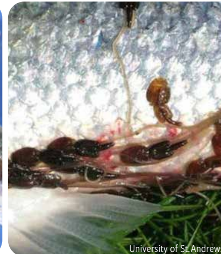
University of St. Andrews