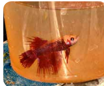
Betta fish living in dirty water at a pet store.

Many breeds of fish sold in pet shops are selectively bred or genetically altered in ways that are adverse to their health. For instance, bubble-eye goldfish have large skin sacs under their eyes which impair their vision and make them susceptible to injury and infection.