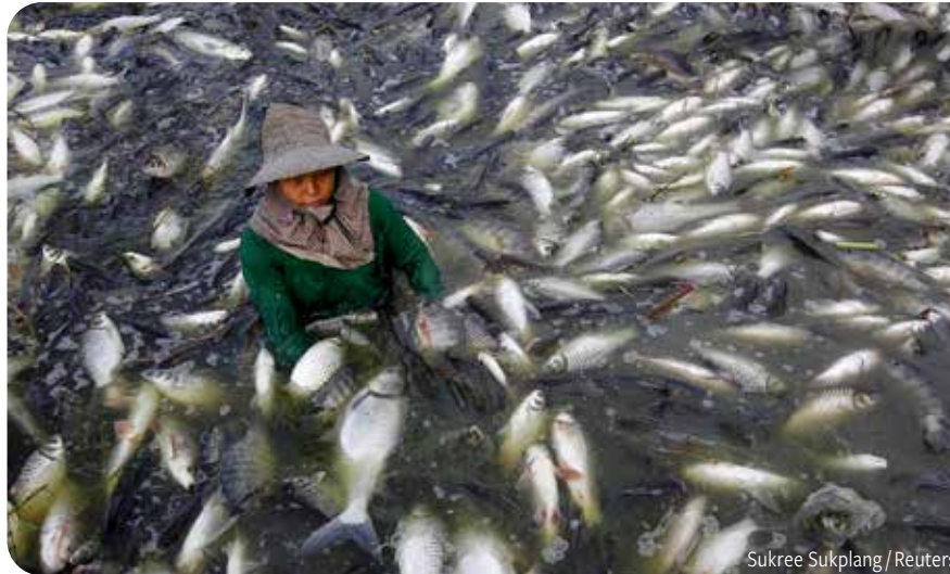
Tilapia living in dirty water on a fish farm in Thailand.