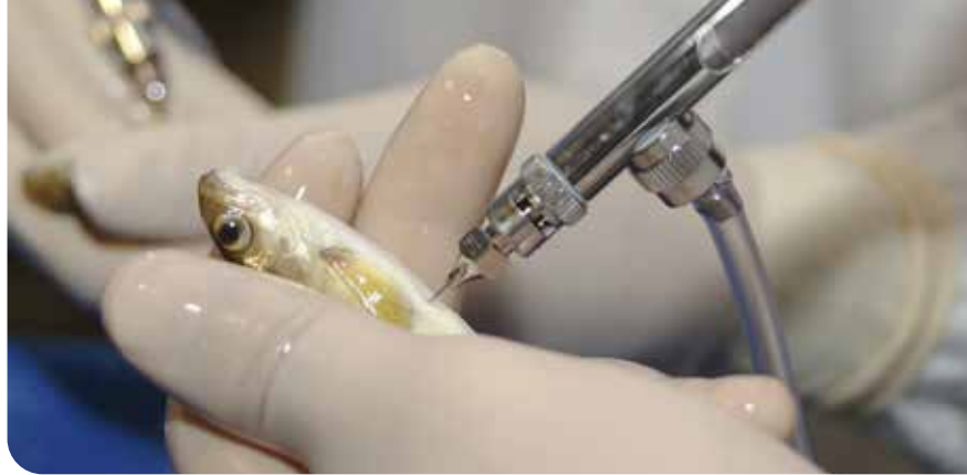
Farmed fish being injected with vaccine drugs.

Prior to slaughter, fish are starved for days to empty their guts. Since fish are generally not protected under humane slaughter laws, they are killed in barbaric ways which include being suffocated, frozen to death, and decapitated. They may also be gassed with carbon dioxide, causing them to hemorrhage blood from their gills. In many instances, fish are brutally skinned and butchered while fully conscious.